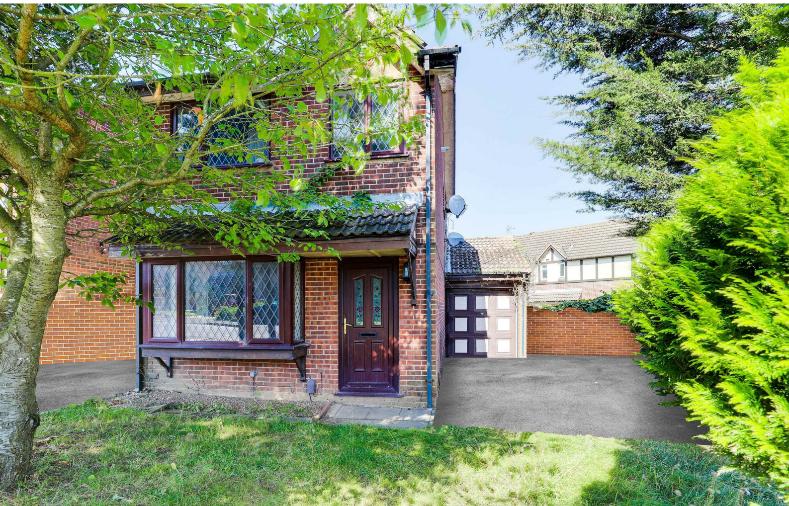
Bolingey Way, Hucknall, Nottinghamshire NG15 6GZ